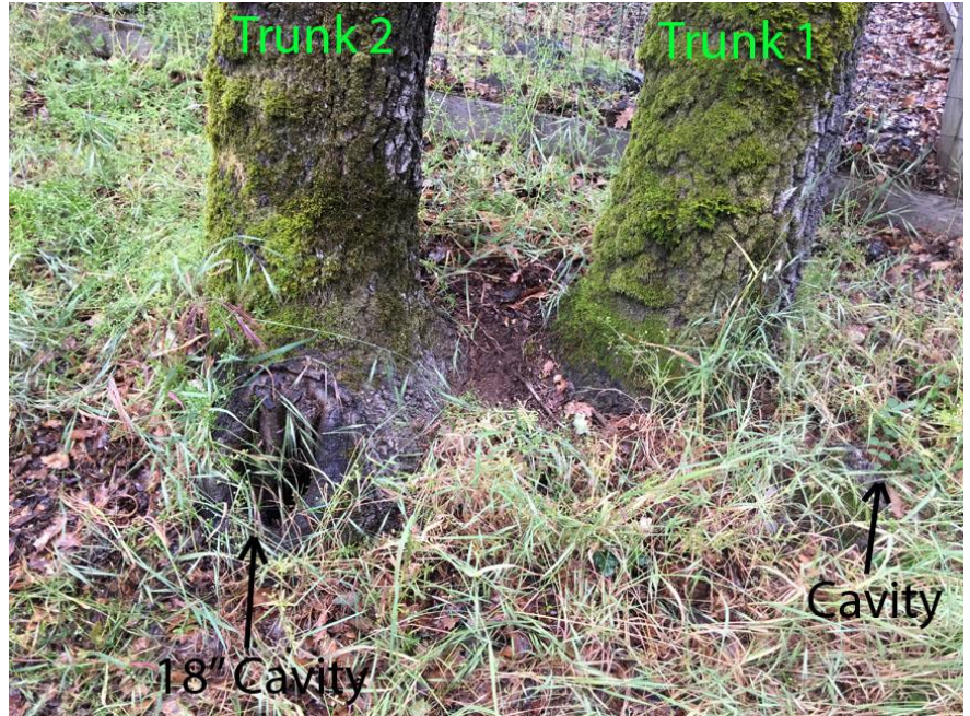
Tree #1 – T-1 is structurally unstable and in the process of failure.