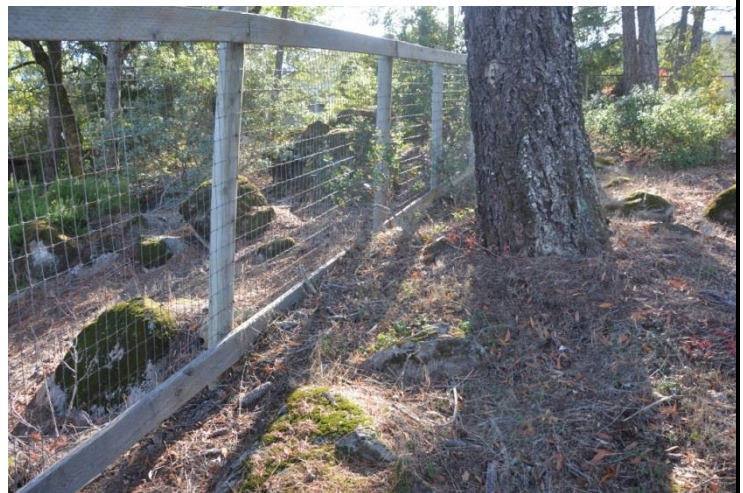
Photo Figure 1 – Tree #2 targets the adjacent homes at 3925 and 3929 Sedgewoore Drive and has been stressed by poor soils and the drought.

It is destabilized by species characteristics, the site soil conditions and drought decline.